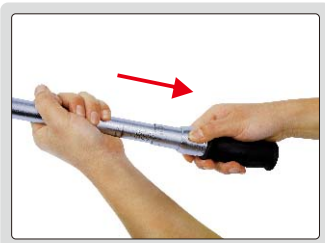
step 1: unlock