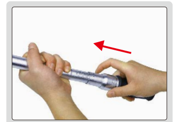
step 3: lock