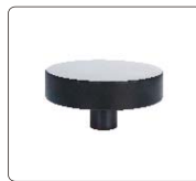
Ø80mm flat anvil (included)