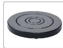
Ø180mm flat anvil (included)