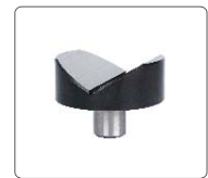
V-type anvil (included)