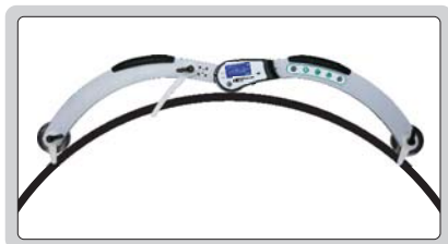
external diameter measurement