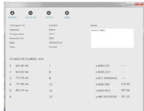
software (included), data output, save and print