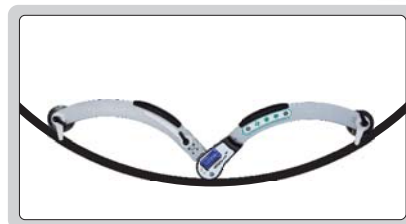
internal diameter measurement