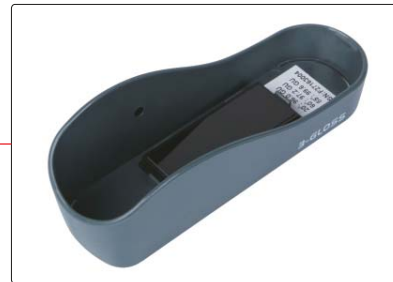
base with calibration block (included)