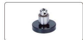
cylinder holder (included)