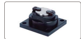
slice holder (included)