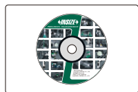
software CD (included)