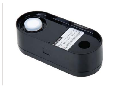
white and black calibration cavity (included)