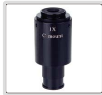
1X camera adapter (optional)