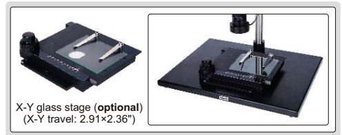
X-Y glass stage (optional) (X-Y travel: 2.91×2.36")