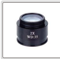
2X auxiliary objective (optional)