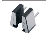
flat jaws (included)