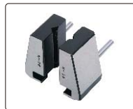
V-shaped jaws (included)