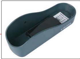
base with calibration block (included)