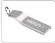
software flash disk (included)

connect to mobile phone via bluetooth (only Android system)