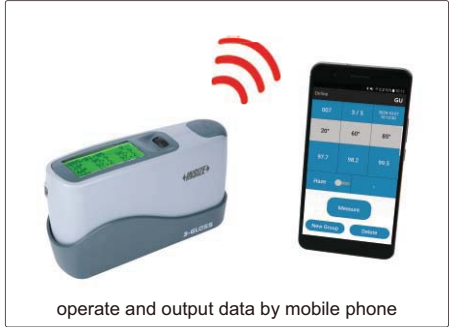
operate and output data by mobile phone

connect to mobile phone via bluetooth (only Android system)