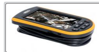
cable can be wrapped around the main unit