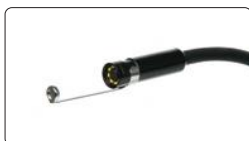
magnet pick up (included)