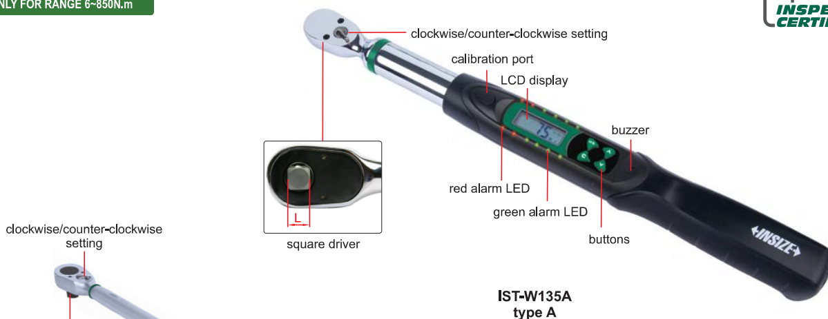
IST-W135A type A