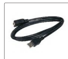
extension cable (included)