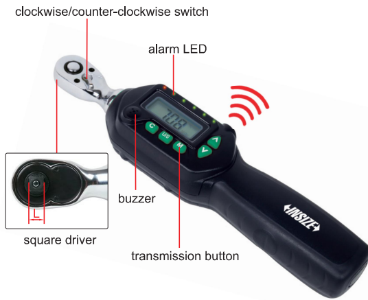
IST-15W12A type A