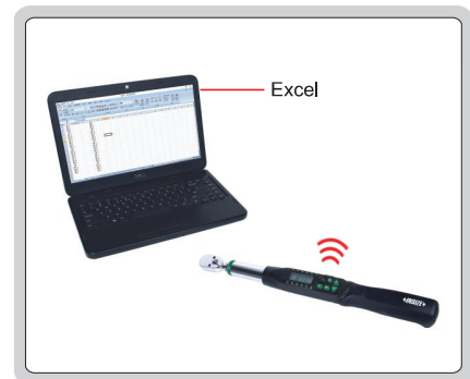
transmission distance is 10 meters (no obstacles, no electromagnetic interference)