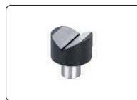
V-type anvil (included) for cylinders with diameter Ø4~60mm