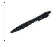
touch pen (included)