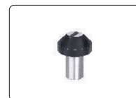
small V-type anvil (optional) for cylinders with diameter Ø2~4mm