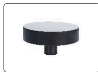
Ø63mm flat anvil (included)