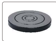
Ø150mm flat anvil (included)