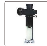
measuring microscope (included)