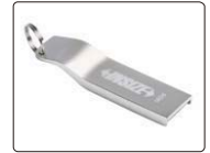
software flash disk (included)