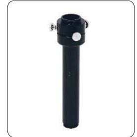
camera adapter (included)