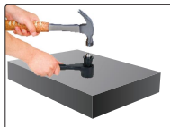
hammer impact to apply test force