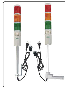
alarm light (optional)