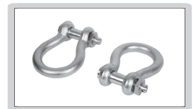
hang scale pull rings (optional)