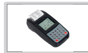
wireless printer (optional)