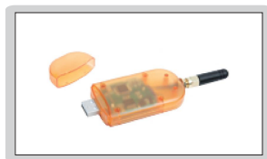
wireless receiver (optional)