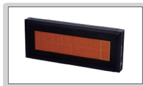
large display (optional)