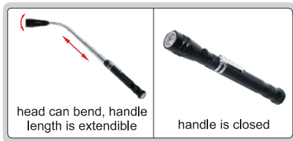
head can bend, handle length is extendible