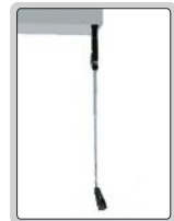
magnetic end to attach on steel surfaces