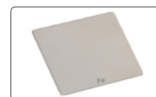
Fe zero calibration plate (included)