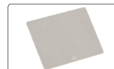
NFe zero calibration plate (included)