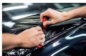
film thickness measurement