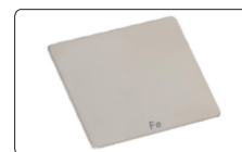
Fe zero calibration plate (included)