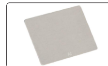
NFe zero calibration plate (included)