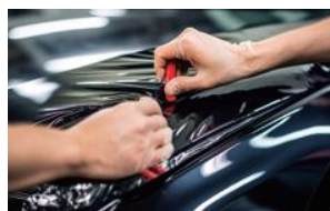
film thickness measurement