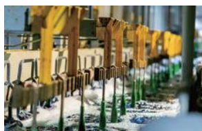
antirust paint layer measurement