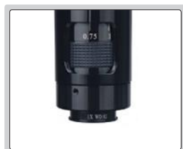
1X auxiliary objective (included)