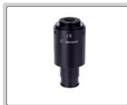
1X camera adapter (optional)