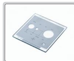
calibration plate (included)