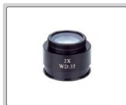
2X auxiliary objective (optional)