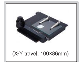
(X-Y travel: 100×86mm)