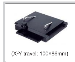
(X-Y travel: 100×86mm)