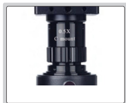
0.5X camera adapter (included)